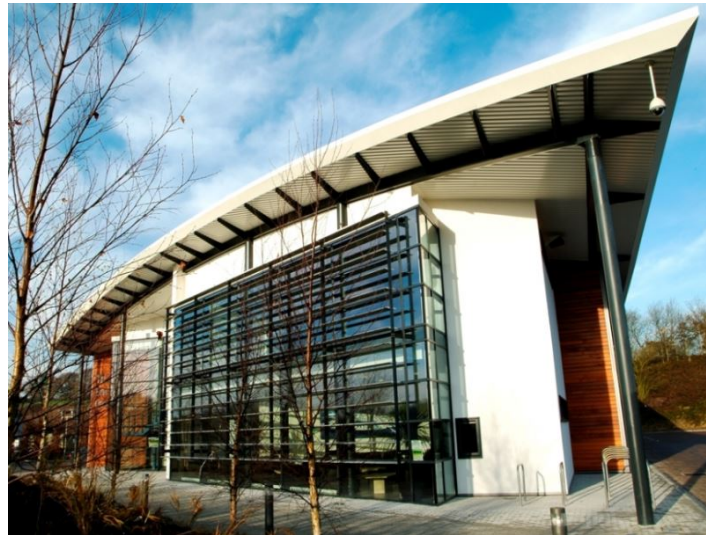
Coxbridge Enterprise Centre Acquired March 2017